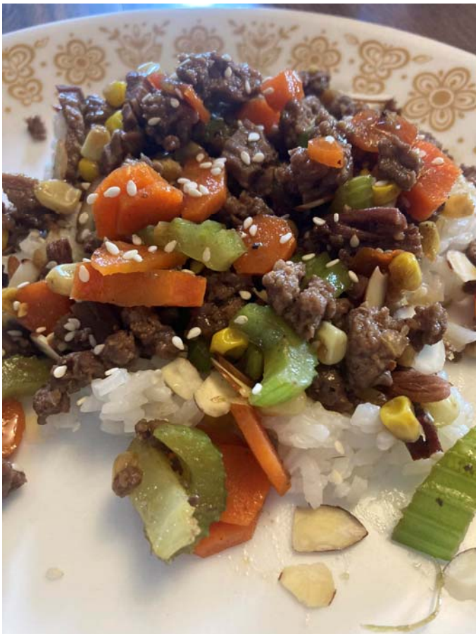
Beef Stir fry 1 lb hamburger, browned or Minute Steak, sliced Sauté desired veggies 2 Tbsp Soy Sauce 1 Tbsp Brown Sugar 1 tsp Garlic salt 1 tsp Ginger Mix together and heat through. Serve over rice.