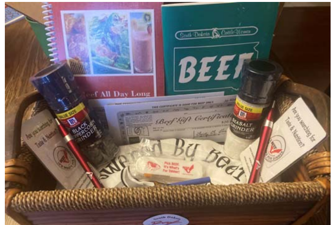
BEEF BASKET . . . Southern Belle CattleWomen donated a beef basket for the Meagan Blare benefit in April. Basket items included: two cookbooks, two beef certificates, a Powered by Beef t-shirt, salt and pepper grinder and two pens, pencils and phone cleaners.