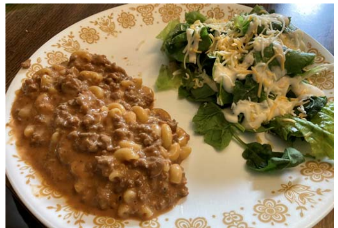
Goulash 1 lb of browned seasoned burger 1/4 cup water 1 Tablespoon vinegar 4 oz Velveeta cheese 1 1/2 cups cooked elbow macaroni 1 (10 oz) can tomato soup Brown the burger and drain. Add remaining ingredients and cooked macaroni. Stir and heat through.