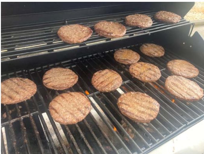
Southern Belle CattleWomen grilled burgers for the concession stand at the MidDakota Fair